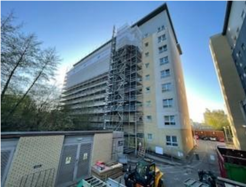
Phase 4 scaffolding ongoing