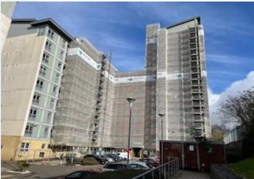
Phase 1-2 Scaffolding